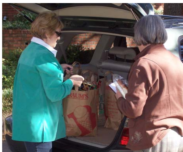
DOUBLE CHECKING THE "BASKETS" WITH THE LISTINGS