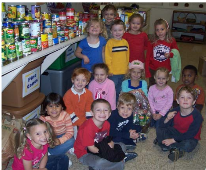
THE ST. PHILIP PDO PRE-K's WITH THE FOOD THEY COLLECTED