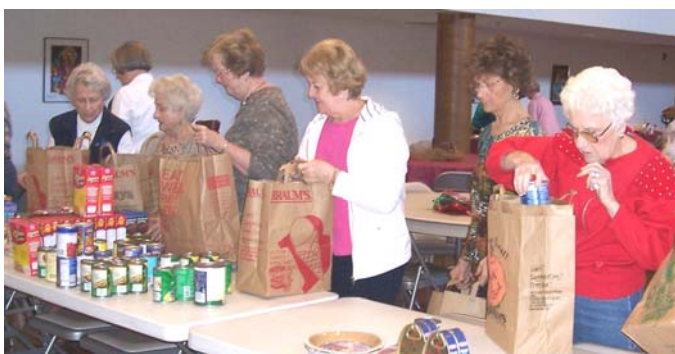
AN ASSEMBLY LINE TO FILL THE "BASKETS" WITH GROCERIES