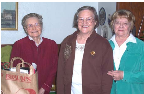
SMILES ALL AROUND WHILE DELIVERING A "BASKET"